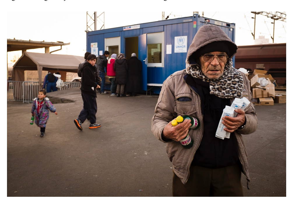
Morning food distribution, UNHCR, Sid transit camp, Serbia- Croatia