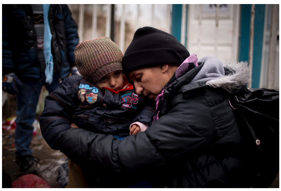
Refugee woman holding her son at the bus station, the family have no money for the rest of the journey.