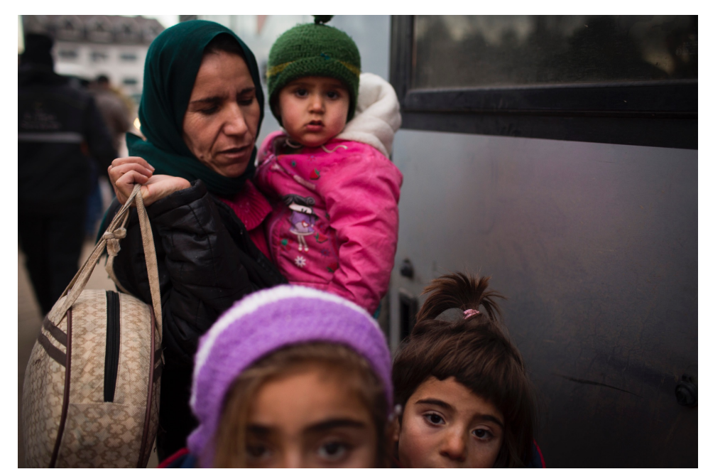
A Syrian family gets on the bus to Croatia