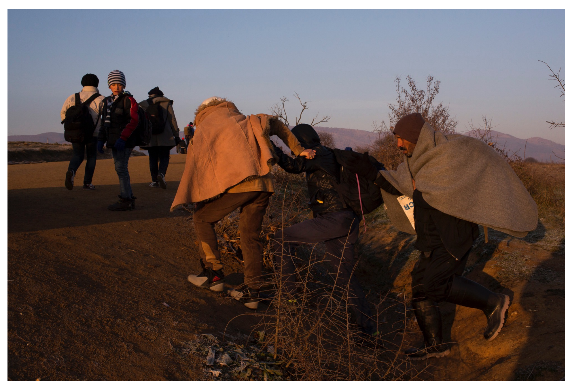
Syrian refugee make the harsh crossing from Macedonia to Serbia.