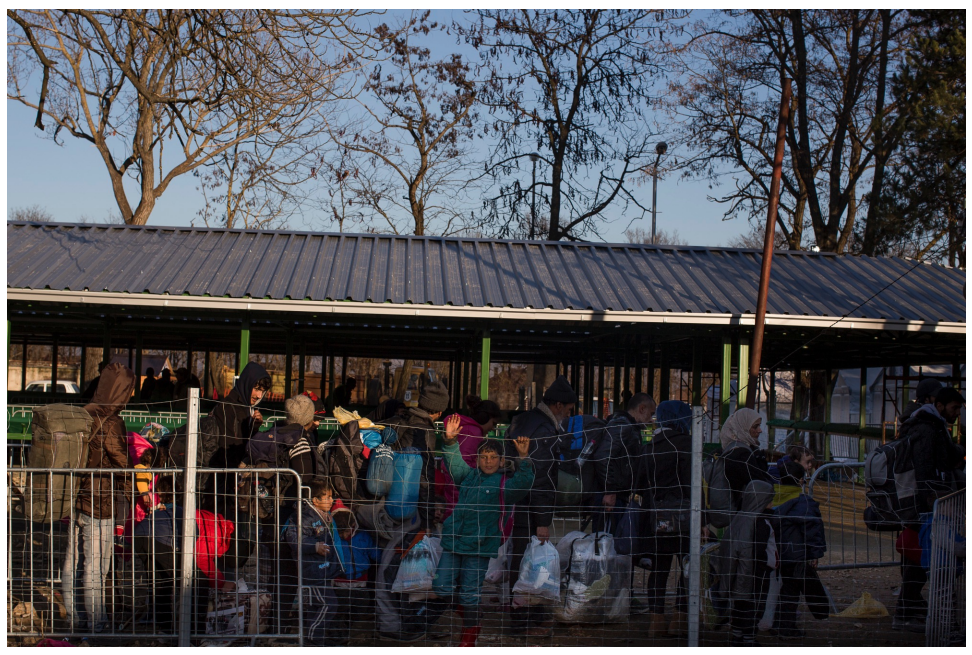
Syrian refugees line up for hours to register in Presevo camp, Serbia