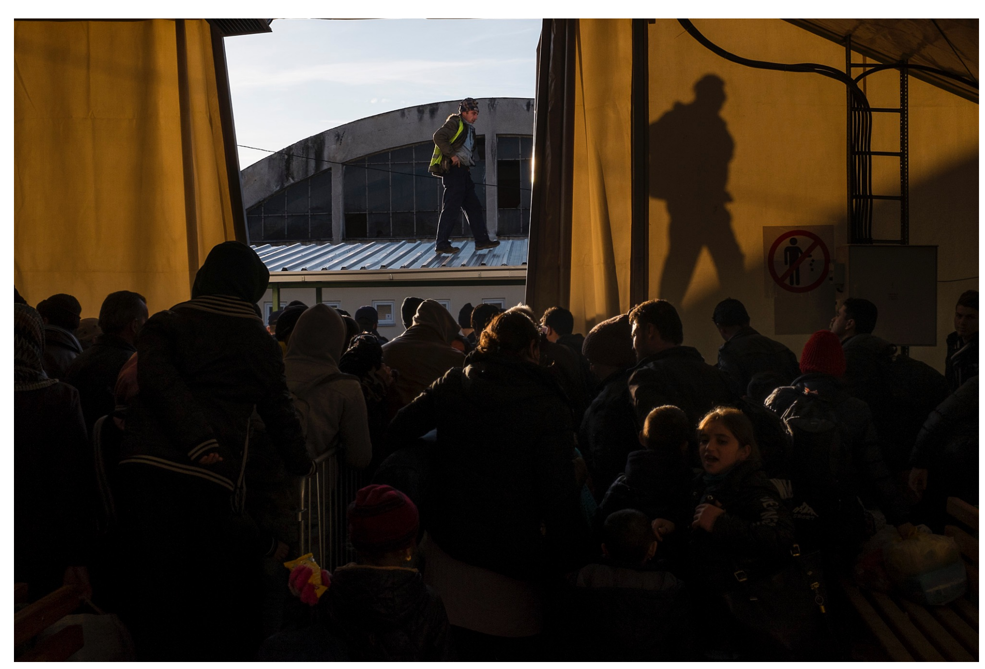
A Serbian guard watches over Syrian refugee waiting for registration in Presevo camp.