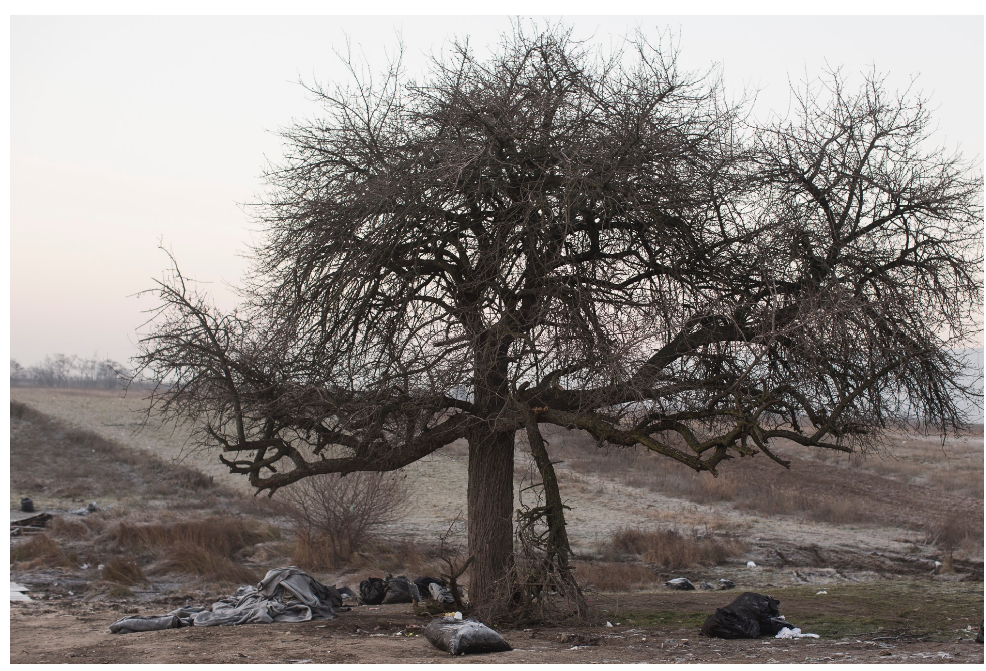
Macedonia Serbia border