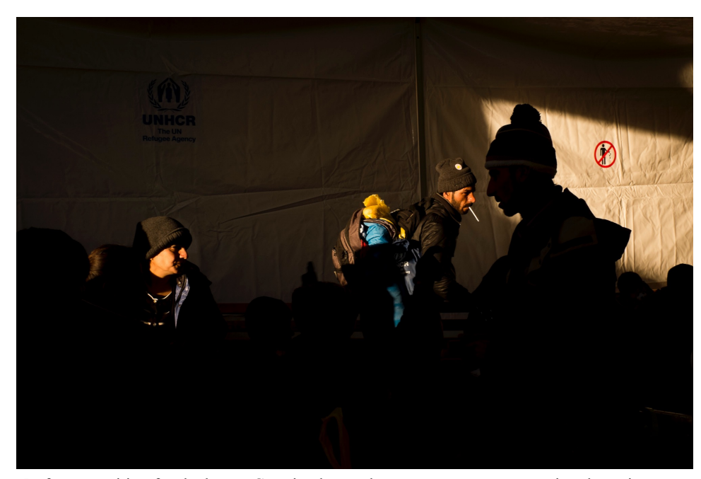
Refugees waiting for the bus to Croatia, those who want to save money using the train.