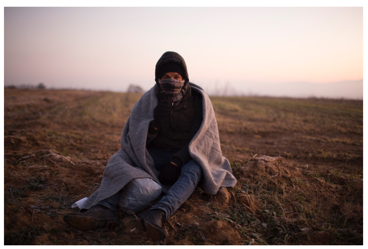
Syrian refugee gathers his strength after 5 km walk from the train station on the Macedonia border and into Serbia.

Estimates of deaths in the Syrian conflict since it began in 2011 vary, with figures ranging from 140,200 and 340,125, per opposition groups, More than four million refugees escaped the civil war in Syria, another eight million are displaced inside Syria.