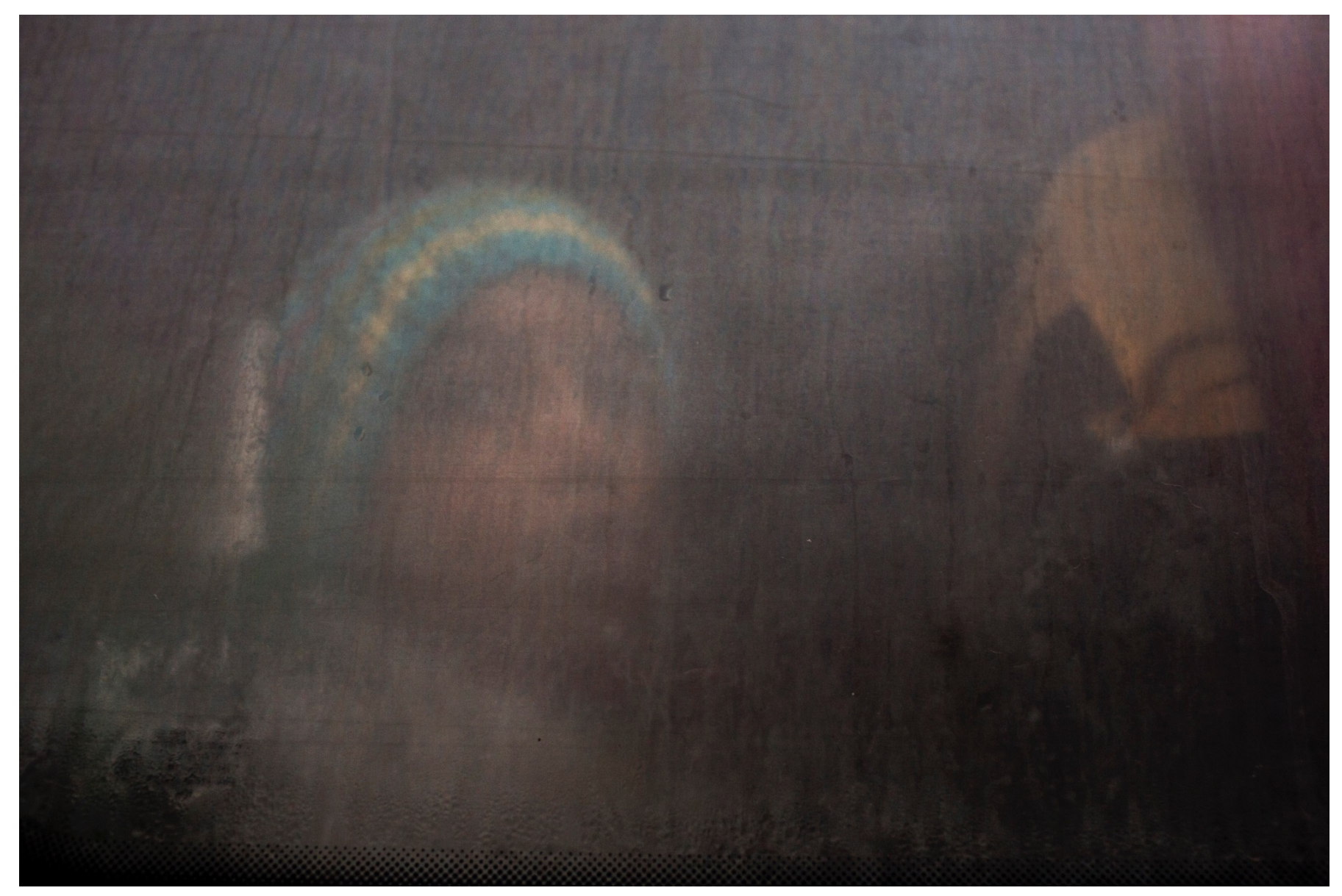
Syrian kid in the bus to Sid on Serbia Croatia