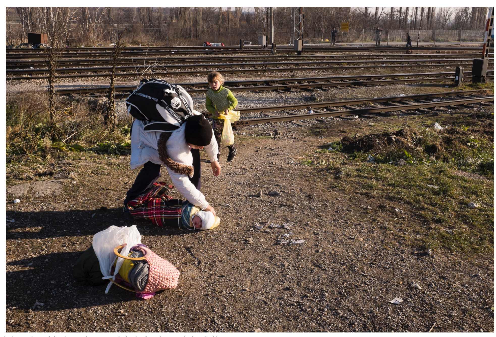
Syrian mother and daughters trying to cross the border from the Macedonia to Serbia