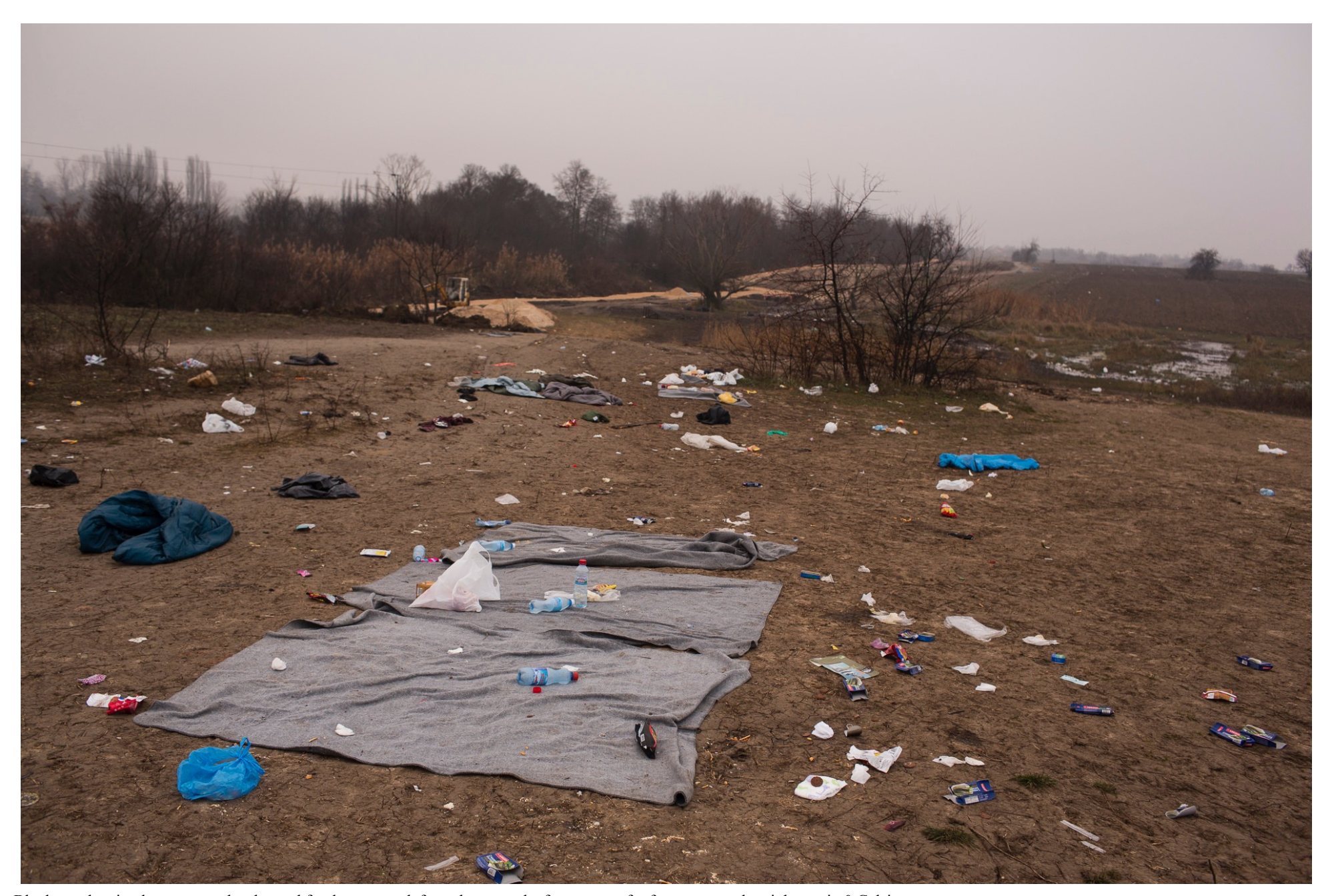
Blankets, sleeping bags, empty bottles and food wrappers left on the ground, after scores of refugees spent the night out in 0 Celsius temperatures