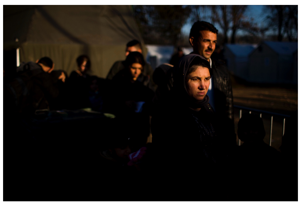
Refugees waiting for the registration in Presevo camp.