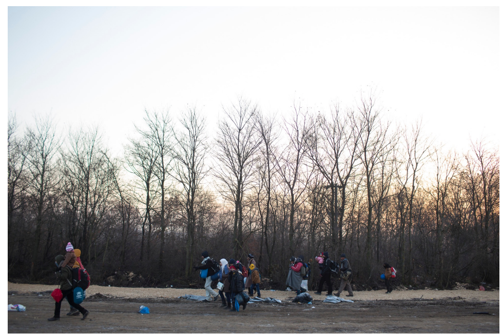
Macedonia Serbia border