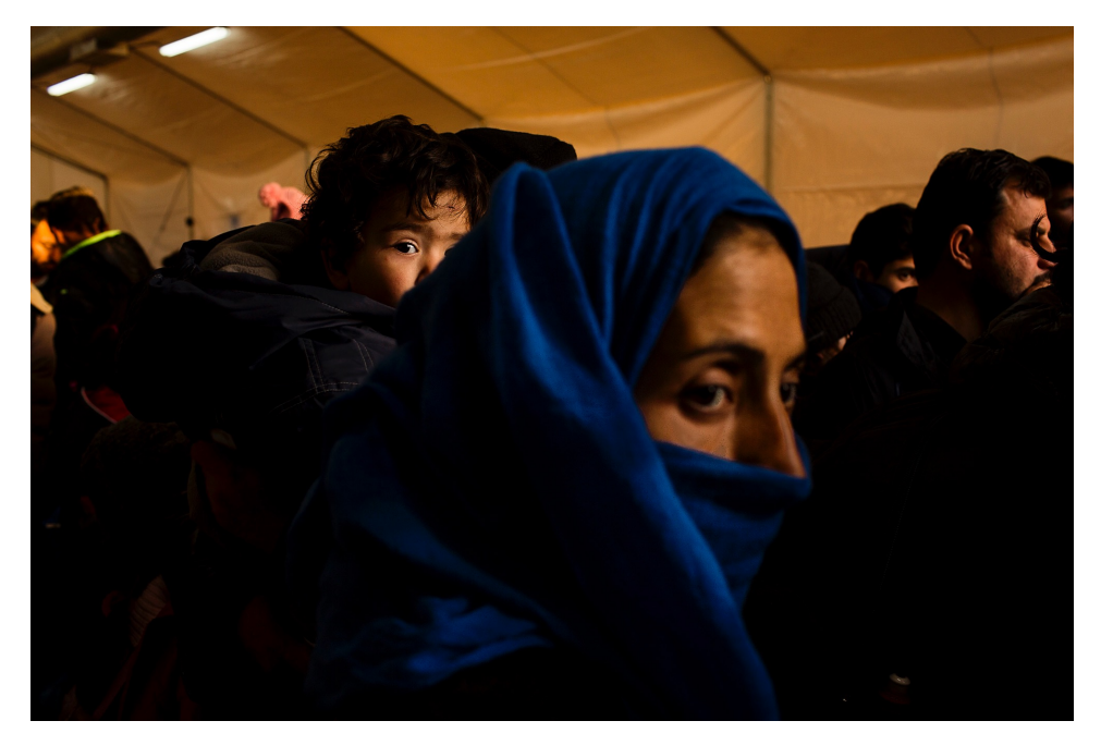
Refugees waiting for the registration in Presevo