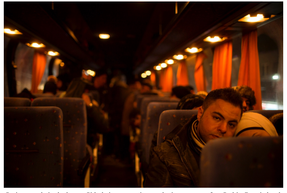
Syrian couple in the bus to Sid, their next station on the journey to safety Serbia Croatia border.