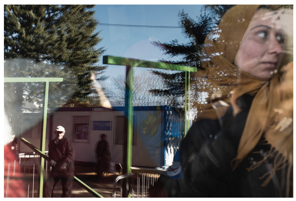
A reflection Syrian refugee woman outside the Medical centre in presevo,