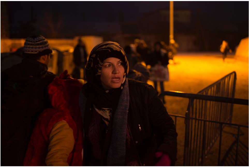
Coming across the border at all hours, day and night, registration in Presevo camp.