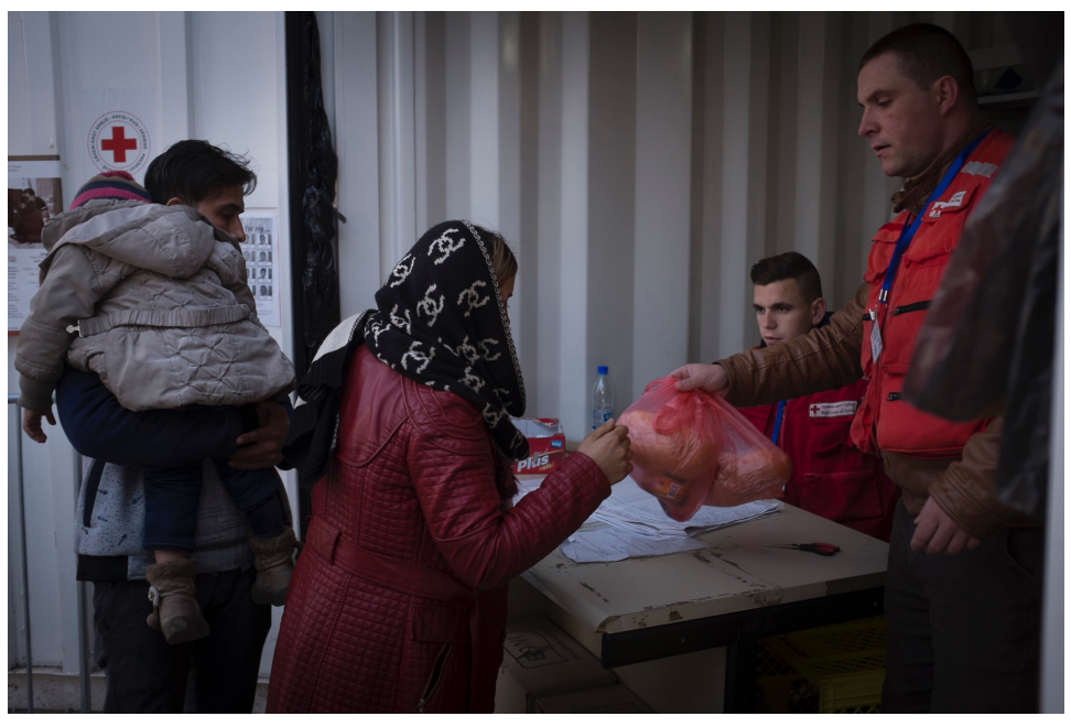
Syrian family receives food rations from the Red Cross in Presevo