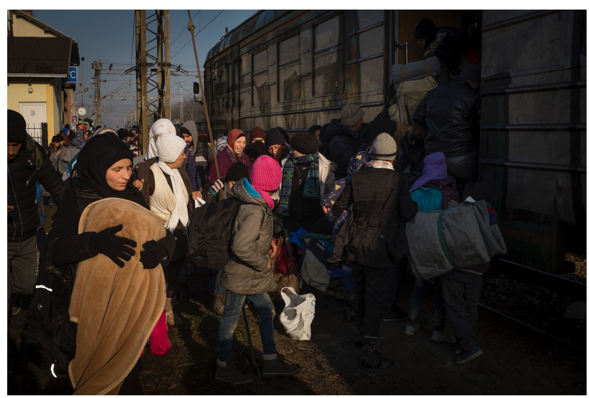
Refugee gets the train to Sid on Serbia Croatia border