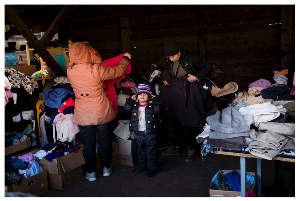
Afghani Refugees try on warm winter clothes in a Belgrade aid centre