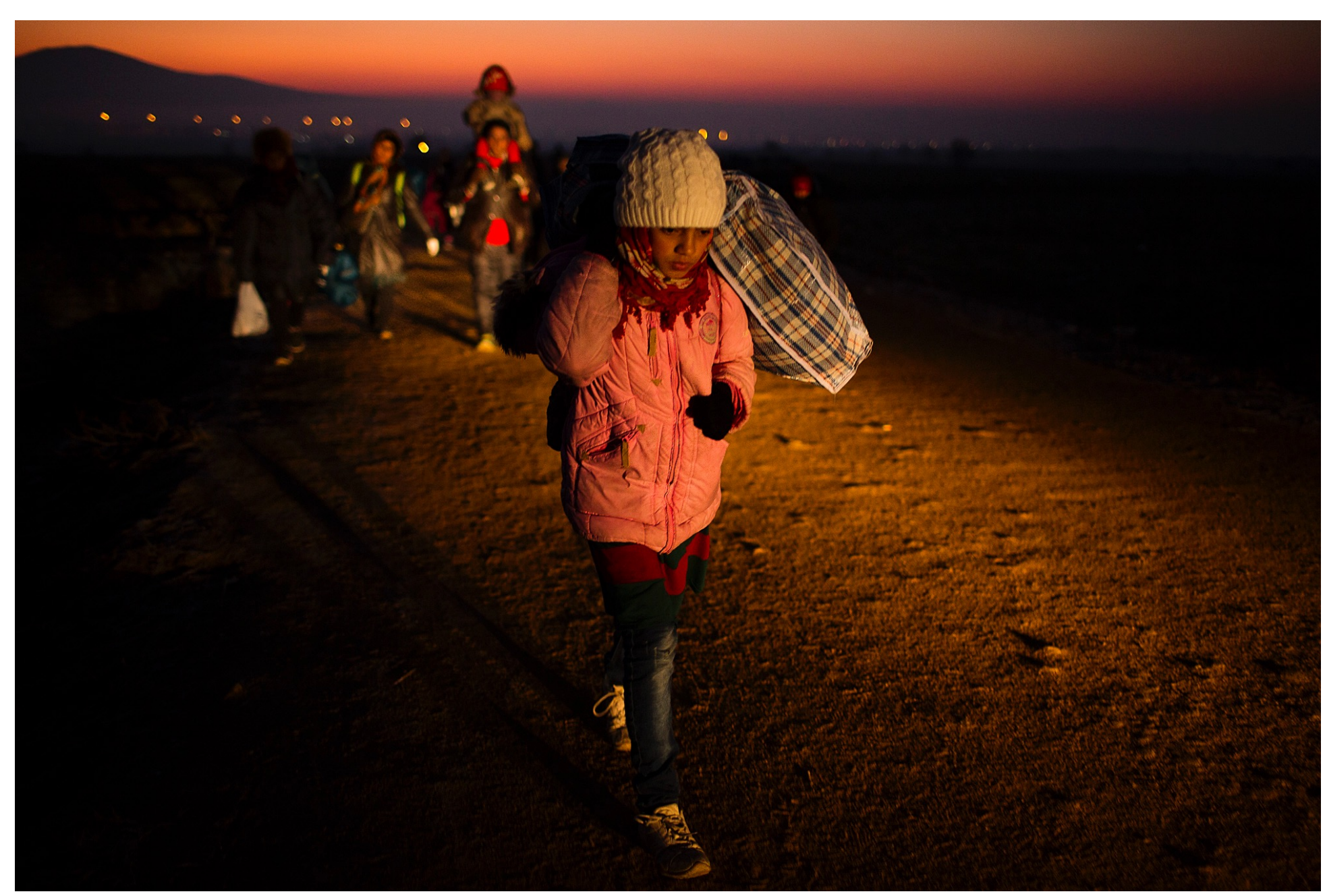
Young Syrian girl carrying the family's belongings, leading the way across the border to Serbia.